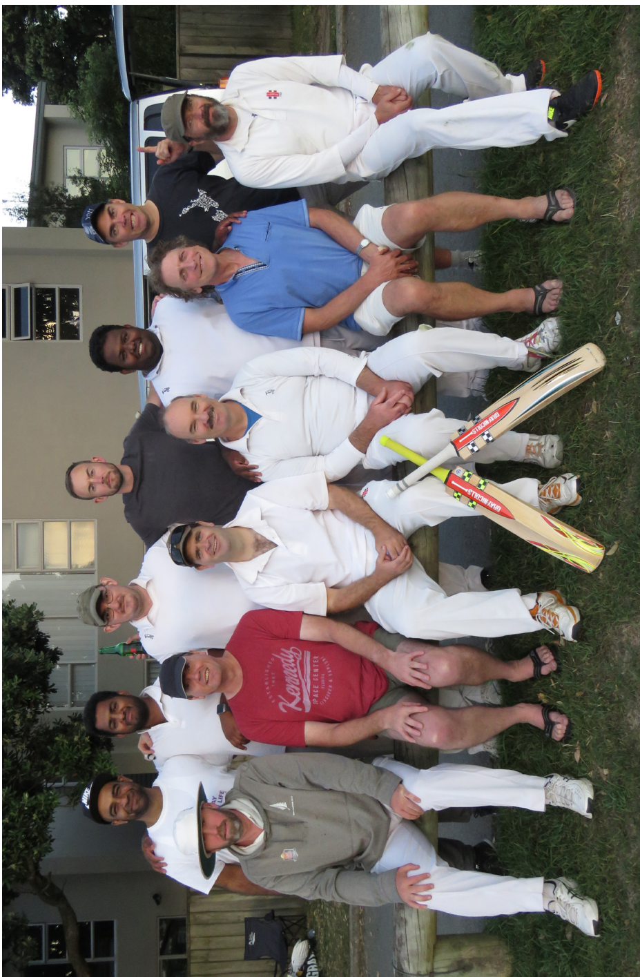
Intercity One Day Shepherds team