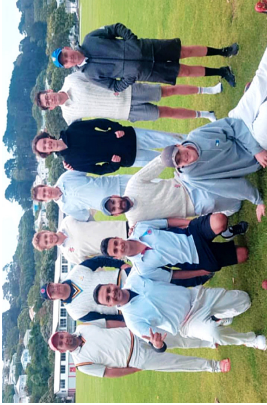
First Grade Cougars