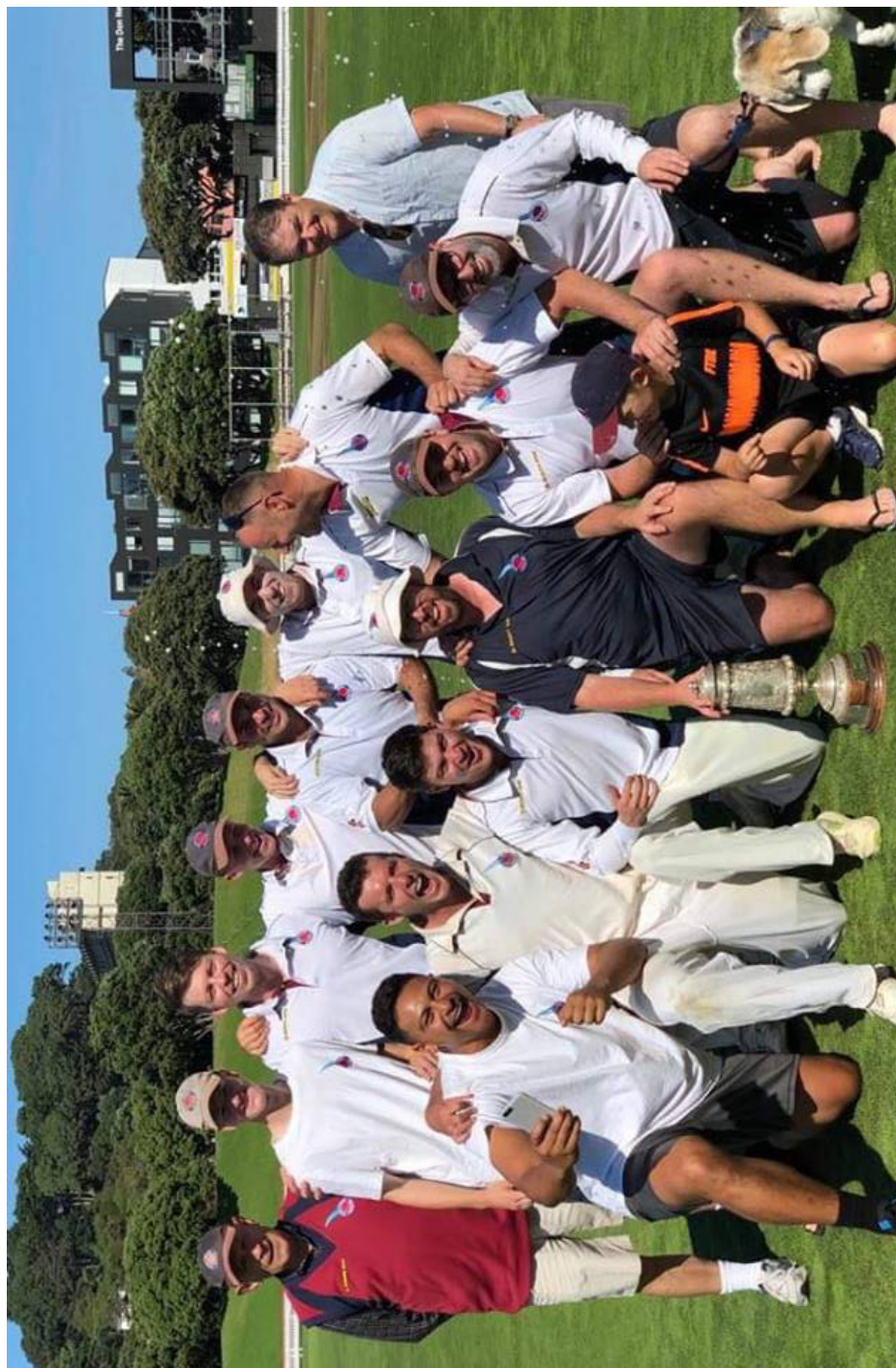
Pearce Cup Champions 2018/19